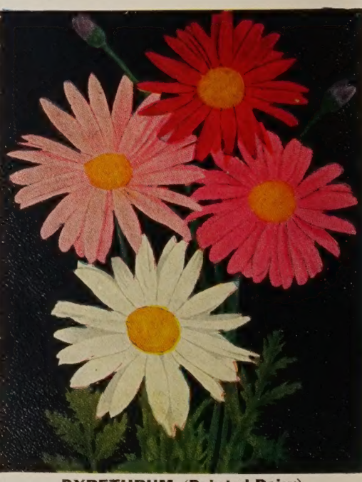
PYRETHRUM (Painted Daisy)

Maybe some of the "old-timers" are new to you. Why not get acquainted with them?